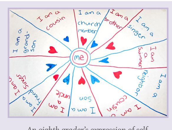
An eighth grader's expression of self.

"Breathing in and out helps me deal with my anger." —Fourth grader