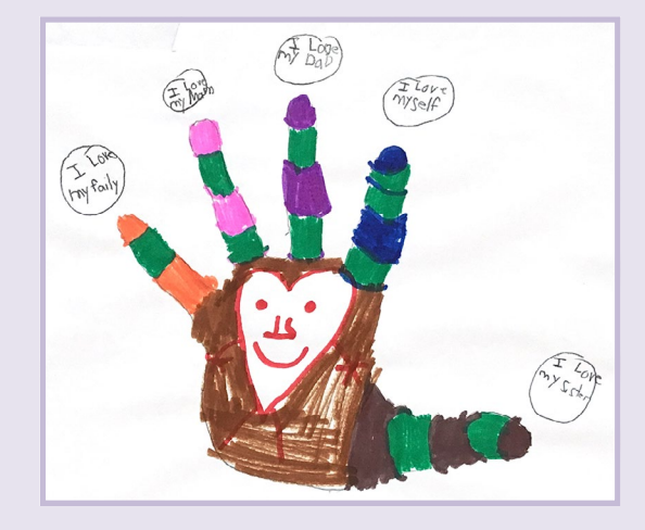
"What I am grateful for."—Third grader