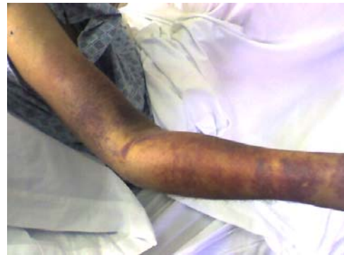
Patient with acquired Factor VIII Deficiency