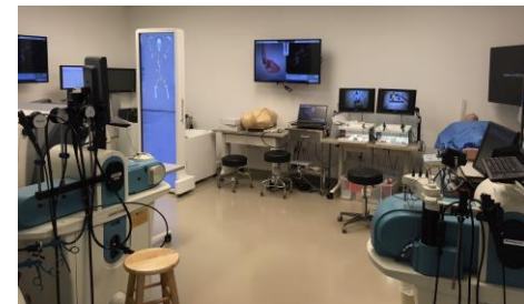
Virtual Reality Room