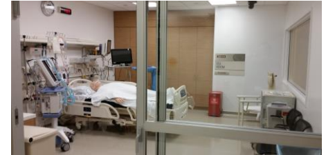
Intensive Care Unit (ICU)

CEDARS-SINAI WOMEN'S GUILD SIMULATION CENTER FOR ADVANCED CLINICAL SKILLS