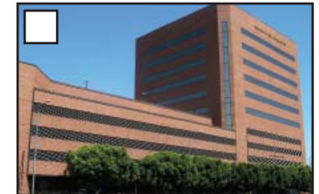
E Mark Goodson Building

8631 W. Third St., Suite 120 East, 1st Floor Parking Lot P4 Suggested