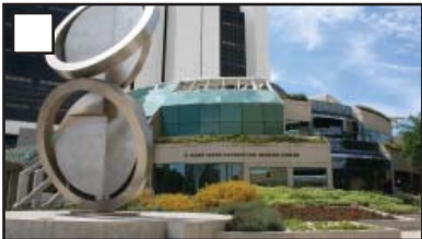
A S. Mark Taper Foundation Imaging Center

Corner of San Vicente Blvd. & Gracie Allen Dr. 8705 Gracie Allen Drive Valet and Patient Drop Off in Front; Valet and Self-Parking in Lot P4