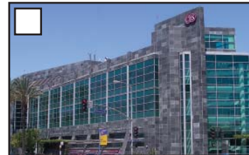
C Marcia Israel Mammography Center

127 S. San Vicente Blvd. Suite # A-2500 (Imaging on Plaza Level) Valet and Self-Parking Available in Lot P4