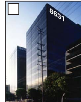
D Medical Office Towers

310 San Vicente Blvd., 2nd Floor Parking On Site